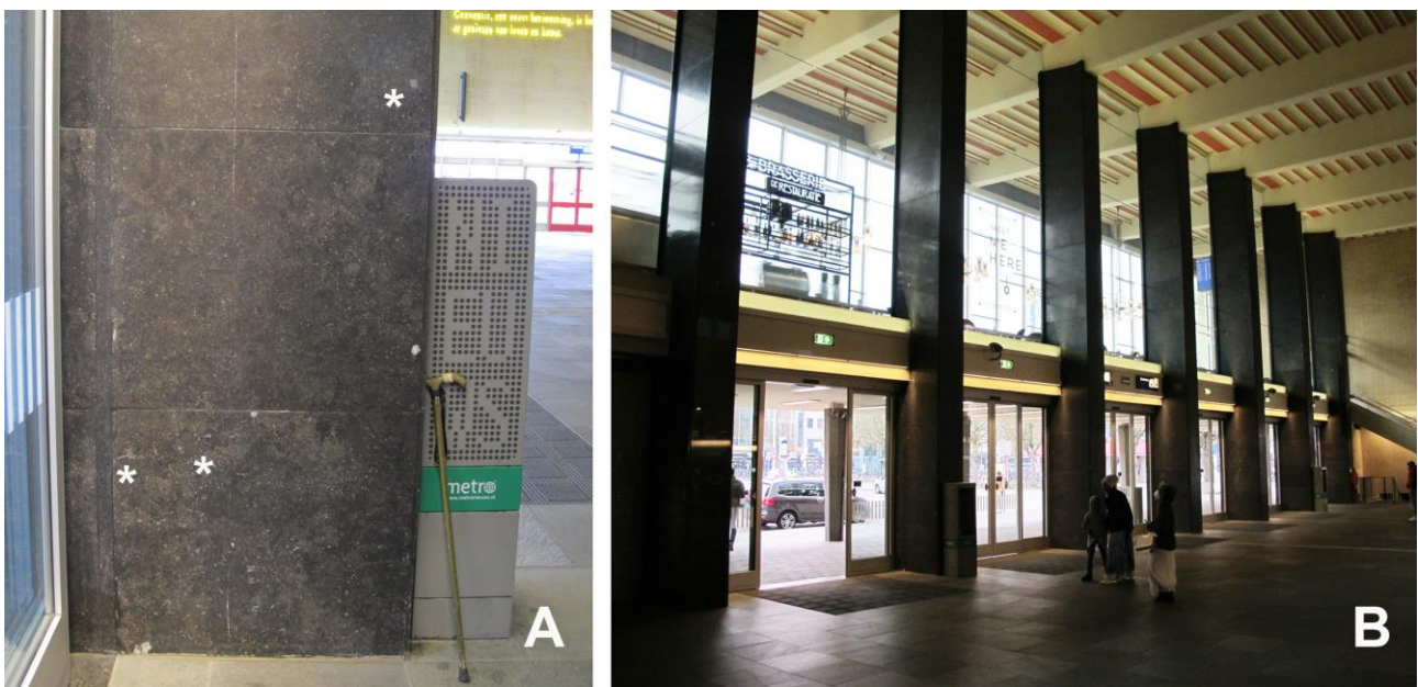
Fig. 1. Mississippian limestones of Eindhoven station, the Netherlands. A , The facing stones that include the specimens discussed herein, marked by (*). Upper right = Fig. 2A; lower left = Fig. 2B; centre left = Fig. 2C. The cane is about 92 cm long. B , General view of the main exit to the station; the pillar on the right side of the nearest (far left) exit contains the crinoids discussed herein.

Proxistele and crown (Figs 1A (lower left), 2B): A crinoid in longitudinal section. The proxistele (= proximal column) is heteromorphic, being comprised of